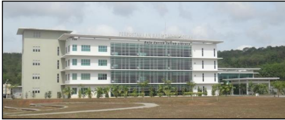
JLPT JOHOR BAHRU EXAM CENTER Raja Zarith Sofia Library (Perpustakaan Raja Zarith Sofia)